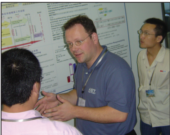
Tailored training courses to suit customers' needs can be provided onsite anywhere in the world.

For detailed information please contact AST via email at contact@ast-tech.de or dial +49 (0)5221 58 954 659.